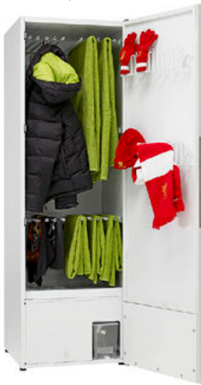
Bas Perfect for the family!

Our most common drying cabinet has three different fitting levels.