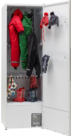
Extreme Perfect for preschools or ski cabins!