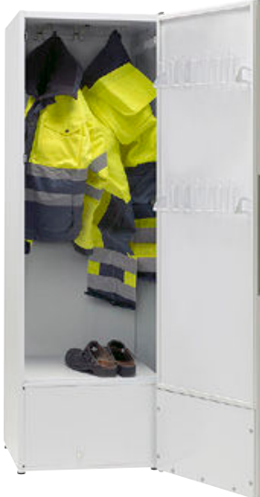
Bod Perfect for the workplace!